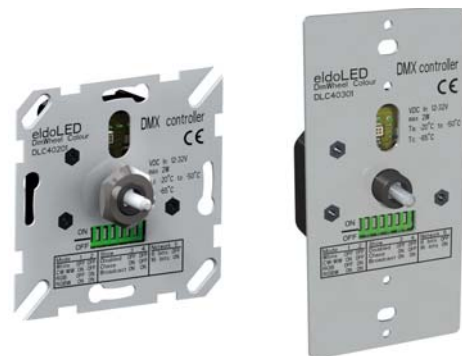
DimWheel Colour EU/UK (DLC40201) and US version (DLC40301)

DimWheel Colour offers two types of show modes: broadcast and chase. You can use broadcast mode for mood lighting where all connected luminaires receive the same set point (=colour) and use chase mode for linear dynamic applications. You can define and upload show sequences to the DimWheel Colour yourself by connecting the eldoLED TOOLbox to the DimWheel's LedSync-in interface and using the freely available TOOLbox PC software.